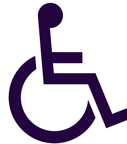
Housing & Facilities