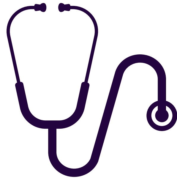
Home Care Services